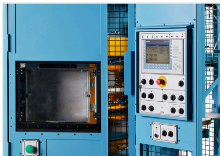
Automatic Core Setter (CSE)