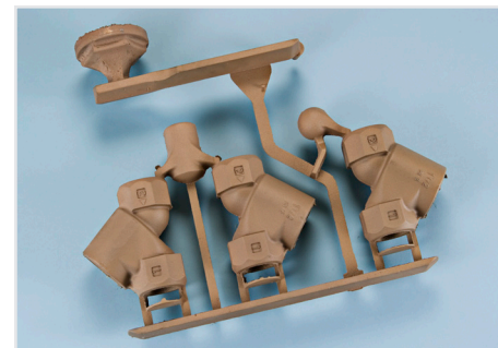
Examples of copper castings